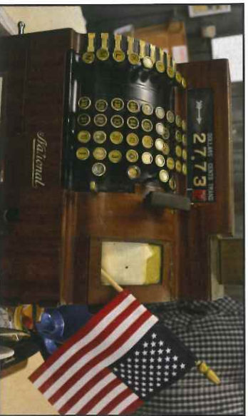
Original cash register still sits on the counter at H.E. Warren Store.